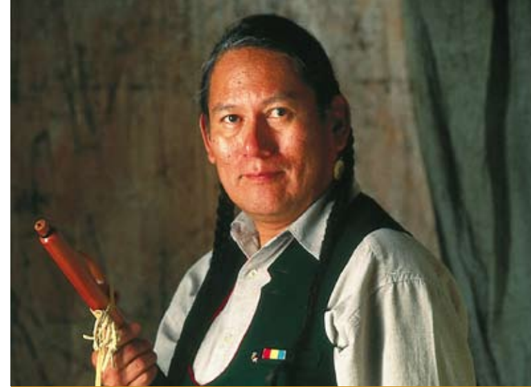
World-acclaimed flute musician R. Carlos Nakai, Navajo/Ute , is a featured performer at the 2010 Indian Fair.

EXCLUSIVE EARLY-BIRD SHOPPING FOR HEARD MEMBERS ONLY Saturday, March 6, 2010 8:30 to 9:30 a.m.